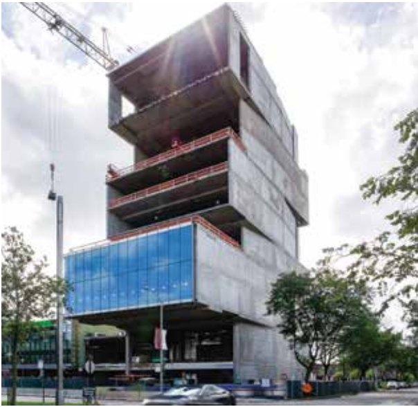
The tower's efficient form is derived from a box-like structure created by the unique stacking of slabs and cantilevered walls.