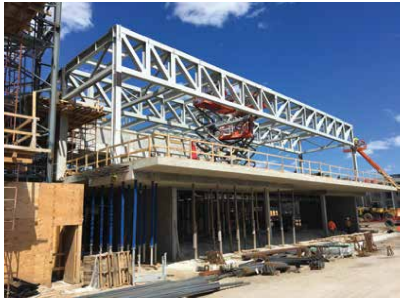
At the podium, a pair of steel roof trusses rest upon and are transferred by a system of cantilevered post-tensioned slabs and beams at Level 2.

hard in isolation, but together, they work harmoniously to meet the project's requirements.