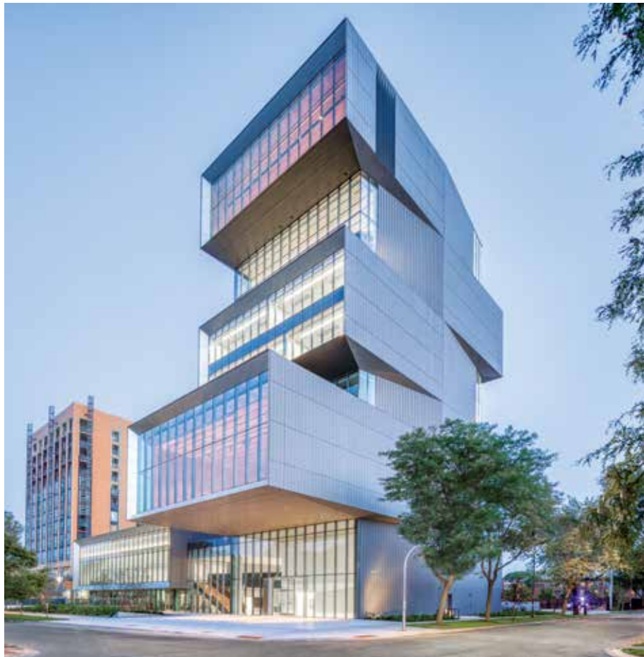
The staggered design of the tower features cantilevers of up to 40 feet.